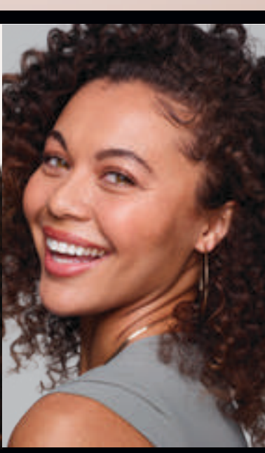
JUVÉDERM® Injectable Gel Fillers IMPORTANT SAFETY INFORMATION (continued)