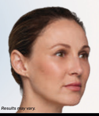
JUVÉDERM® Injectable Gel Fillers IMPORTANT SAFETY INFORMATION (continued)

1.0 mL of JUVÉDERM® ULTRA XC in the lips TOTAL: 8.1 mL